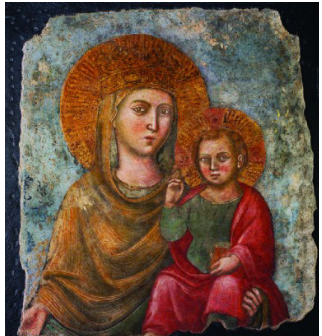
SECULAR INSTITUTE „MADONNA DELLA STRADA“